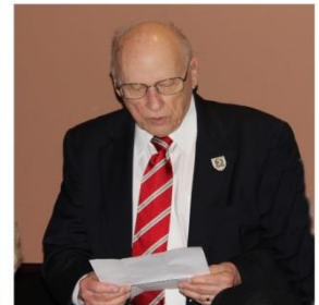
This Day in History Done Stone