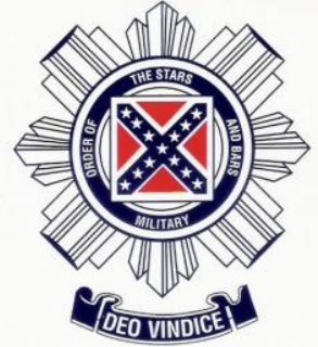
VOLUME I ISSUE 5

Major Benjamin F. Ficklin Chapter 310 – San Angelo Military Order of the Stars and Bars