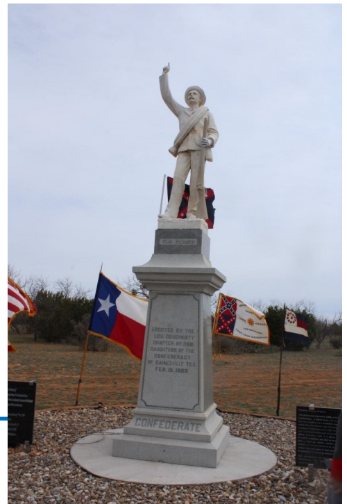
(Right) Monument's new home