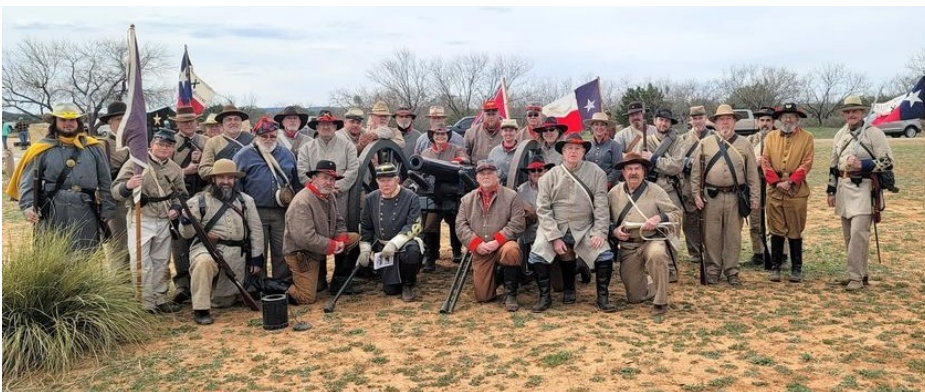
Goode's Light Artillery and Texas 7 th Infantry