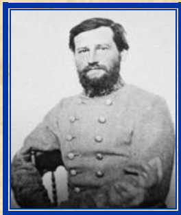
Lt. General Stephen Dill Lee, Commander United Confederate Veterans New Orleans, Louisiana, April 25, 1906

“Remember, it is your duty to see that the true history of the South is presented to future generations.”