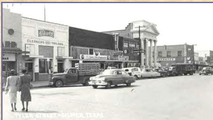
Tyler Street, Gilmer, Texas - Early 1950's

Upcoming Events may be found on the Calendar at: www.upshurpatriots.org