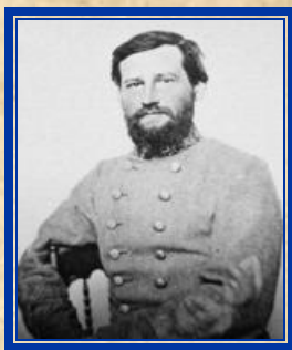
Lt. General Stephen Dill Lee, Commander United Confederate Veterans New Orleans, Louisiana, April 25, 1906

“Remember, it is your duty to see that the true history of the South is presented to future generations.”