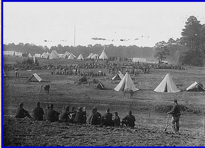
Union soldiers guarding Confederate prisoners. Circa 1861-1865

little at a time to make sure the batter is not too runny. Heat the bacon grease in a cast iron skillet and drop in the batter by the spoonful. Brown on both sides and serve while hot.