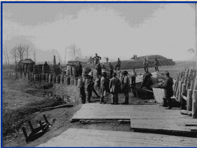
Manassas, Virginia 1862

Upcoming Events may be found on the Calendar at: www.upshurpatriots.org