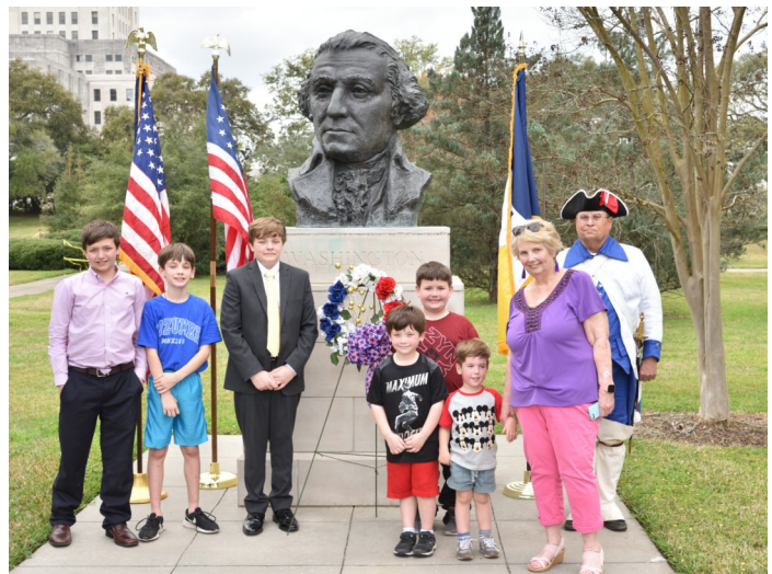
CAR Members attending.