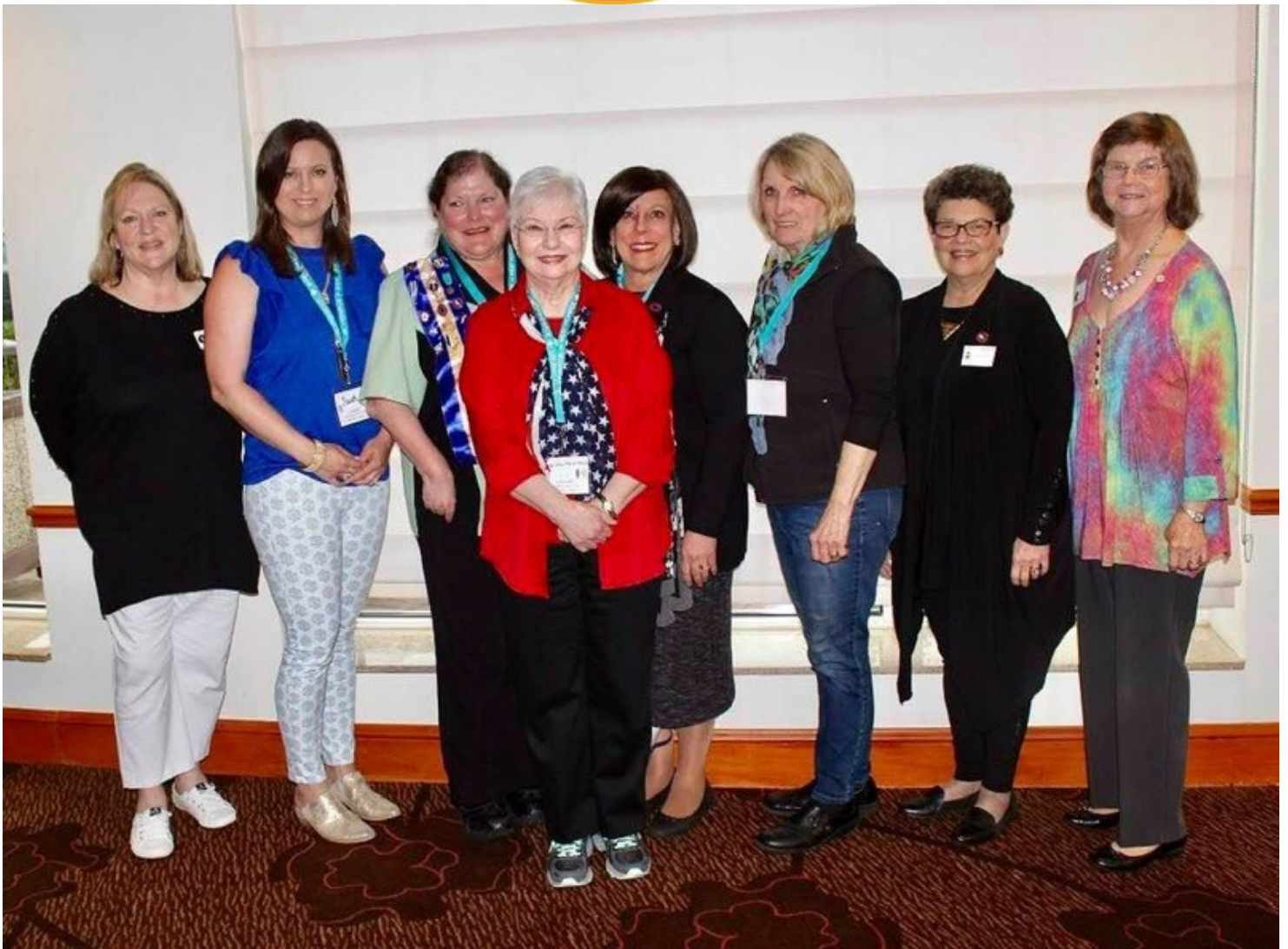
Ladies Auxiliary Meeting at the State Meeting in West Monroe, April 5-6, 2019