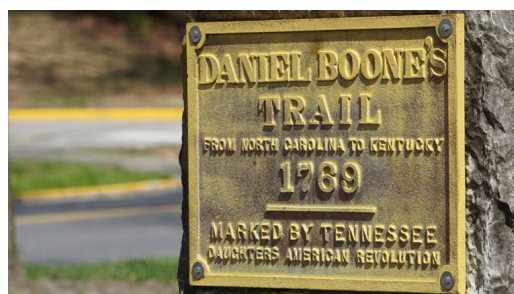
Sign for Daniel Boone's trail