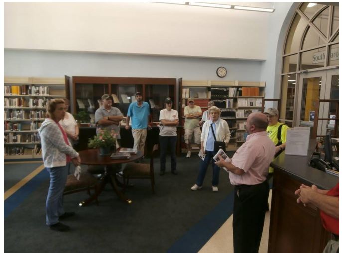
Inside the South Carolina Room at the Florence County Library