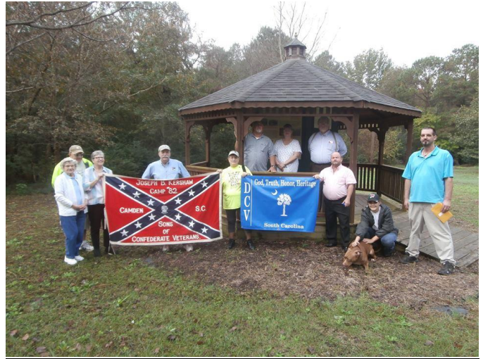
Some of the attendees at the Florence Prison Stockade Gazebo