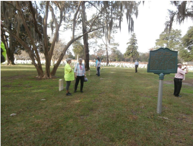
Looking at the graves of unknown Federal soldiers that died at the Florence Prison Stockade. They are buried at the Florence National Cemetery.