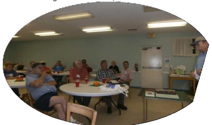
Don't laugh...You should have seen the original photo before I edited it!