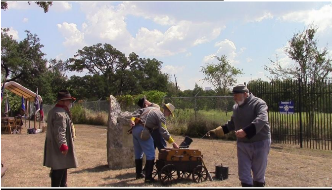
Prepare to fire "DEFIANCE" 1838 Coehorn Mortar