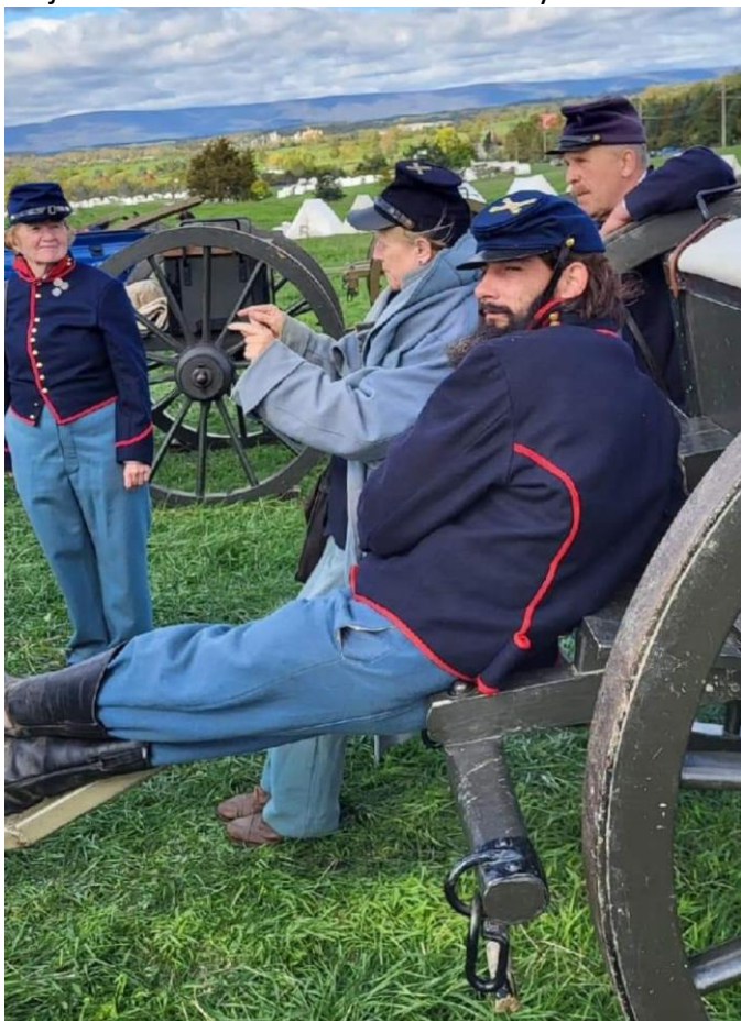
Battery M 2nd US Artillery

Held on the same weekend as Fall Muster at Beauvoir other members of the Barksdale Chapter travelled to Middletown Virginia to participate in the Battle of Cedar Creek reenactment. The Battle of Cedar Creek on October 19, 1864 was the last major battle in the Shenandoah Valley.