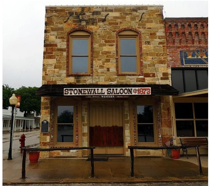
Museum of the Stonewall Saloon Saint Jo, Texas