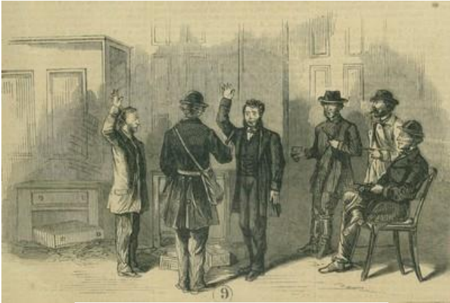
St. Albans bank tellers being forced to pledge allegiance to the Confederacy

Upon entering the St Albans Bank one of the raiders told the bankers. "Not a word We are Confederate soldiers detailed from General Early's Army to come north and to rob and plunder as your soldiers were doing in the Shenandoah Valley