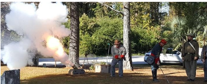
Coehorn Mortar in action