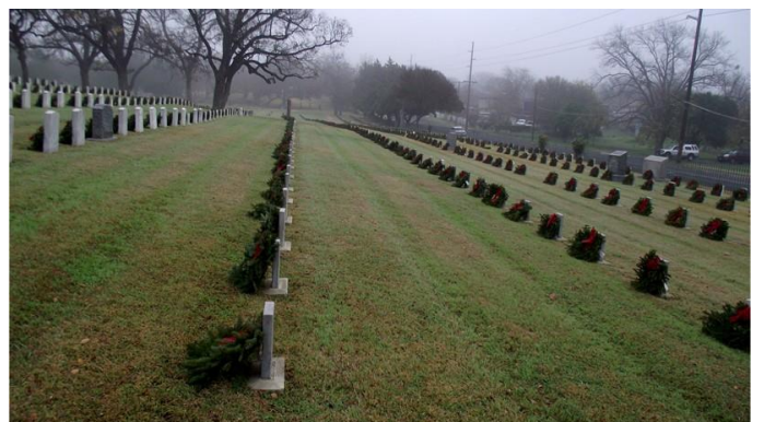
Rest in Peace Loyal Confederates