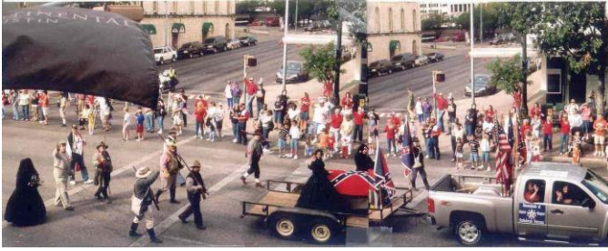
In the early days most marched. 13 years later, not so much.

The DCV was founded in 2005. In 2006 the Capitol Chapter participated in the Austin-Travis County annual Veterans Day Parade on Congress Avenue.