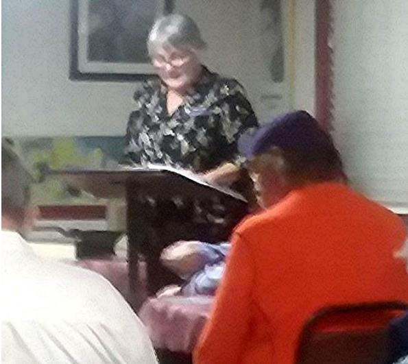
The program covered many Southern women and their importance during the war.