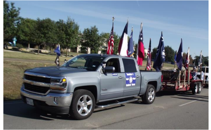
Beautiful Flags, Beautiful day

This year the Capitol Chapter contacted the City of San Marcos about participating in their annual Veterans Day Parade. San Marcos is approximately 30 miles south of Austin. They welcomed our participation and it appears we have found a new home for Descendants of Confederate Veterans