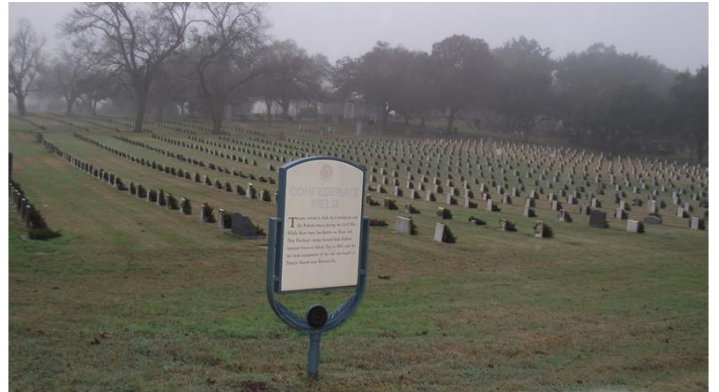
Over 2,200 Confederate veterans and many spouses were decorated with wreaths