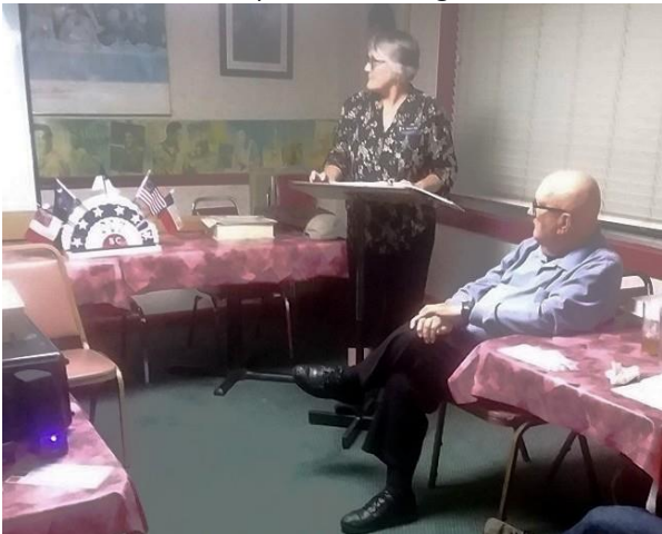
Her excellent power point presentation was on " Women of the Confederacy"