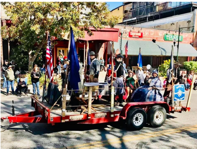
Downtown San Marcos, Texas