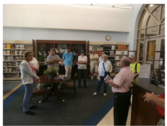
Inside the South Carolina Room at the Florence County Library