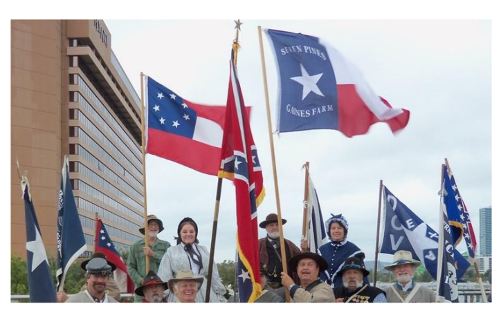
Flags of the Confederacy fly proudly