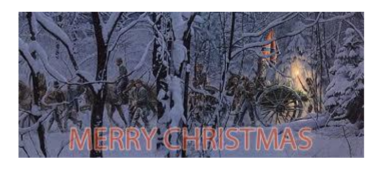
Continued Top of Page