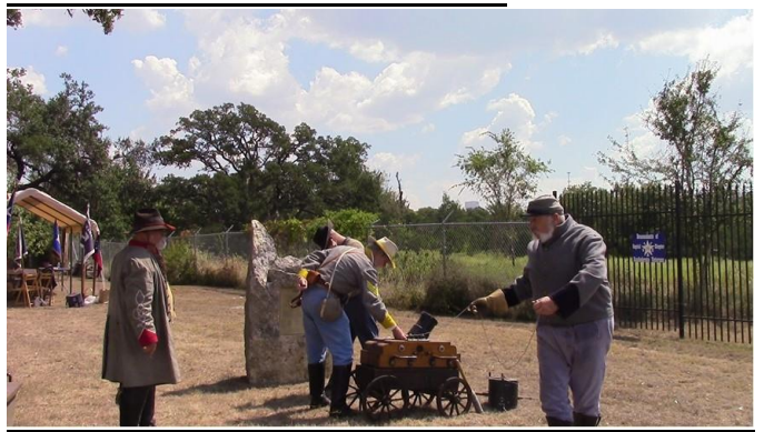
Prepare to fire "DEFIANCE" 1838 Coehorn Mortar