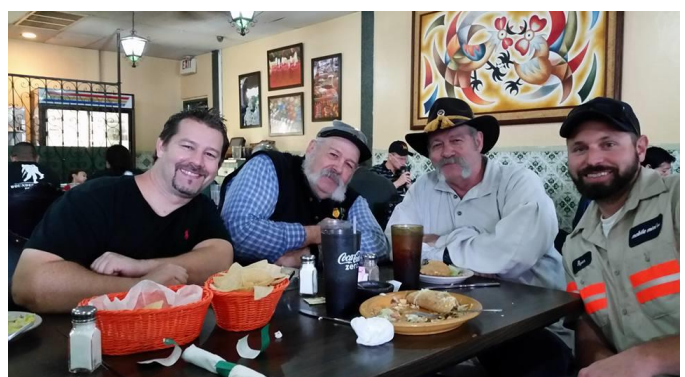
It's not an event until you eat! El Gallo Mexican Restaurant. Less than one mile from the site of Confederate Fort Magruder in Austin, Texas.