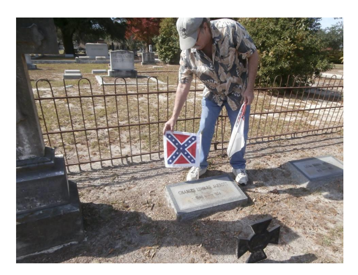
Continued Top of Page