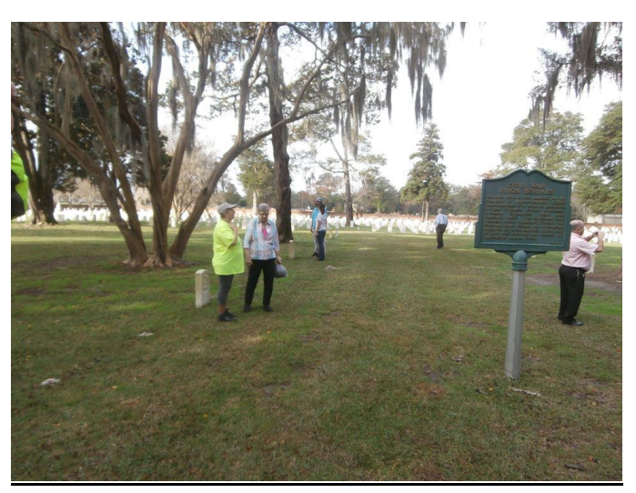
Looking at the graves of unknown Federal soldiers that died at the Florence Prison Stockade. They are buried at the Florence National Cemetery.