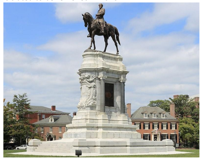
Robert E. Lee Monument in Richmond VA. It was the first monument placed and is the largest of Monument Avenue's monuments in Richmond, Virginia. General Lee's horse is not a representation of his famous mount Traveller. The sculptor did not find the size of the actual horse to be in keeping with the overall composition and therefore created an ideal mount with the necessary requirements. Ralph Northam, Governor of Virginia, announced June 3, 2020 the removal "as soon as possible" of the monument, which is located on state land.