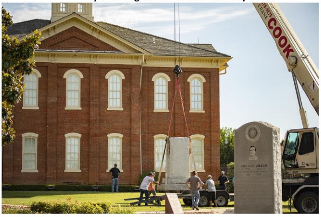
Stand Watie Monument in Tahlequah, Oklahoma. Removed June 13 2020 by Cherokee Nation. The monument was dedicated in 1921 by the Daughters of the Confederacy rather than the Cherokee Nation.