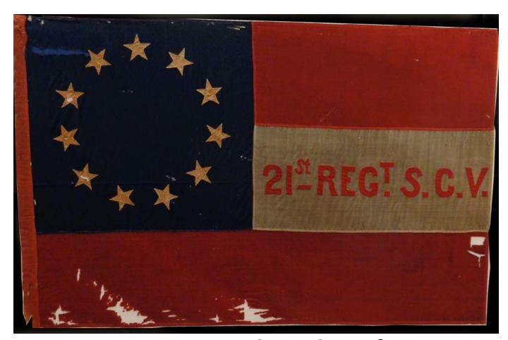
21st Regiment, South Carolina Infantry Manufactured in Charleston in 1863 by the Hayden & Whitten Company. The flag cost $50.00. Flag's dimensions are 41" X 64" inches.

The regimental designation consists of 4.5" red letters and numbers appliqued to both sides of the flag in the center white bar.