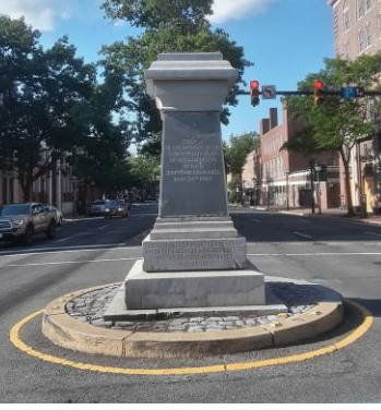
<u>Appomattox</u> is a bronze statue in Alexandria VA commemorating Confederate soldiers from the area, The bronze portion of the statue was removed by the United Daughter of the Confederacy on June 2, 2020.