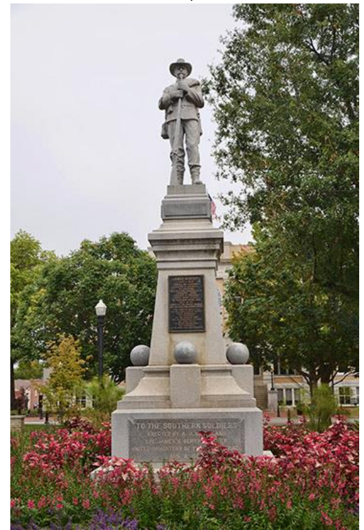
Bentonville Confederate Monument in Bentonville, Arkansas. In August 2020, the monument is scheduled to be moved from the Bentonville Square to a private park near the Bentonville Cemetery.