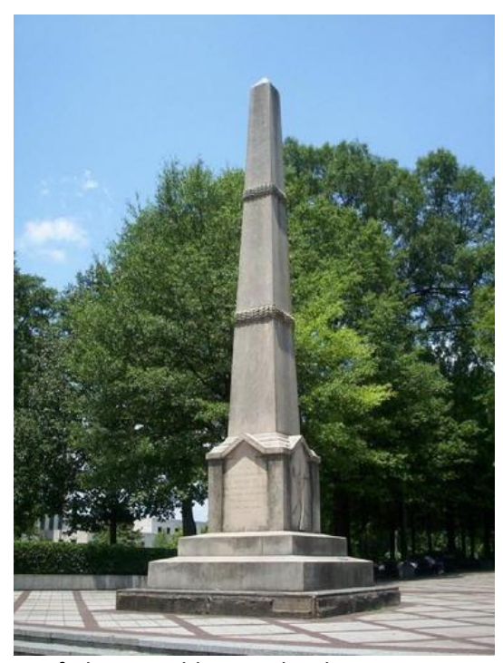
Confederate Soldiers and Sailors Monument Birmingham, Alabama. Dismantled and removed 6-1-20