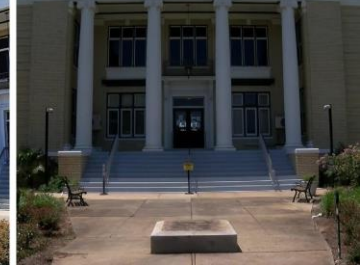
<u>Gadsden Confederate Memorial</u> in Quincy, Florida. The memorial was removed by the County June 11, 2020.