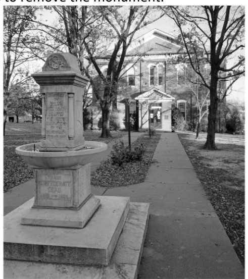
Stand Watie and Confederate Soldier Fountain in Tahlequah Oklahoma. Removed June 13 2020 by Cherokee Nation. The fountain was dedicated in 1913 by the Daughters of the Confederacy.