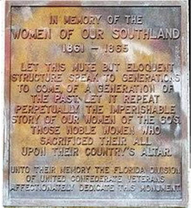
Memorial to the Women of the Confederacy