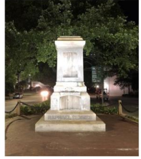
Confederate Naval Officer Raphael Semmes Statue in Mobile, Alabama. Removed on June 5, 2020.