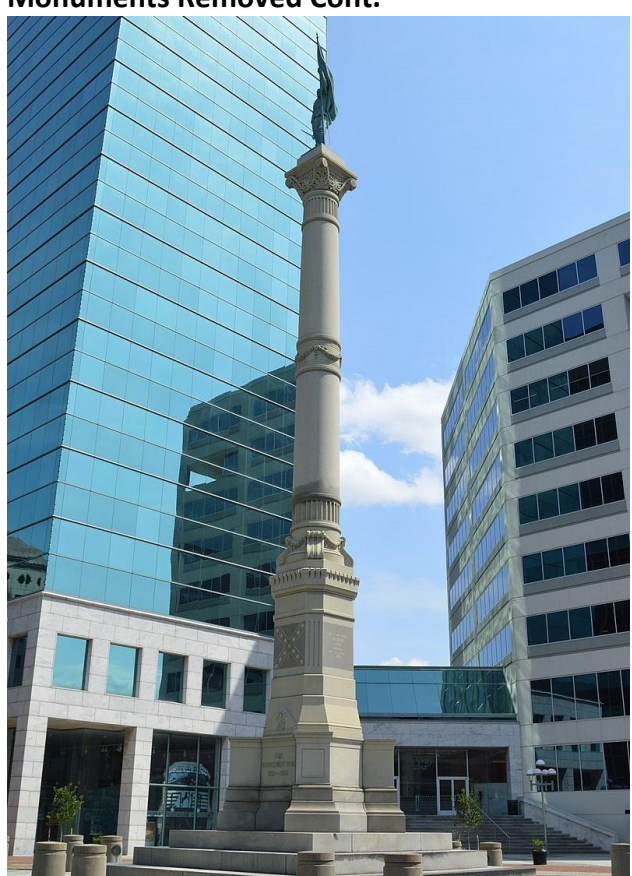
<u>Norfolk Confederate Monument</u> in front of the Norfolk Southern Museum in Norfolk, Virginia. The monument is slated to be removed in 2020