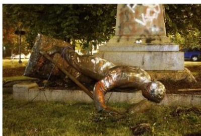
<u>Howitzer Monument</u> in Richmond VA. Near Virginia Commonwealth University's Monroe Park campus Toppled by protesters June 16 2020.