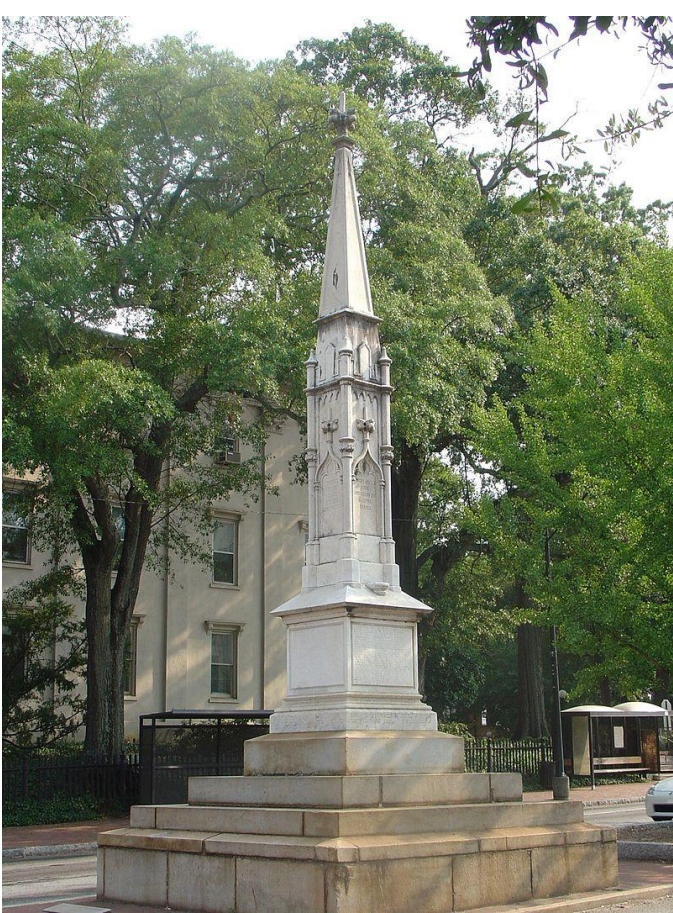
Athens Confederate Monument in Athens, Georgia. It is a Carrara marble obelisk mounted on a granite foundation engraved with names of the city's soldiers who were killed during the War Between the States. Mayor and commissioners announced plans to remove it June 2, 2020