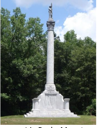
Nash County Confederate Monument in Rocky Mount, North Carolina. The City council voted June 2, 2020 to remove it in 2020. Originally the statue of a soldier sat atop each of the short columns at the base. Two were stolen in the 1970's and the other two removed for safekeeping. They are stored in a city-owned warehouse.