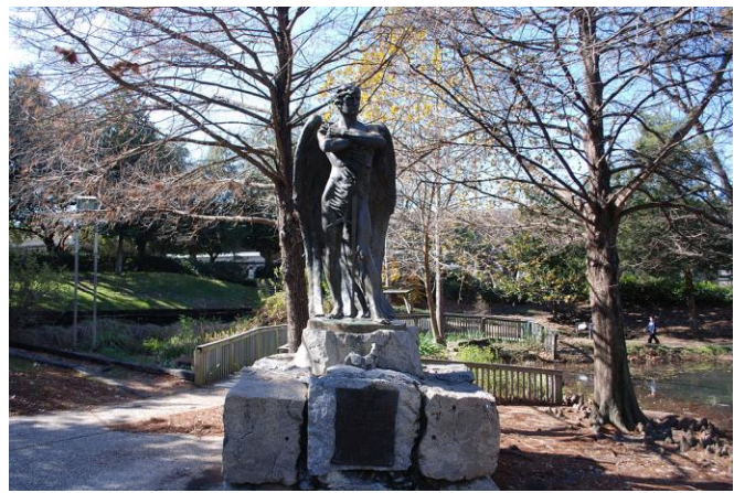
Spirit of the Confederacy , also known as the Confederacy Monument in Houston's Sam Houston Park. It is a bronze sculpture depicting an angel holding a sword and palm branch. Moved June 11, 2020 to the Houston Museum of African American Culture.