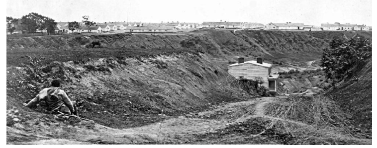
Chimborazo Confederate Hospital Richmond, VA

The SCV stands for "South Carolina Volunteers". The flag was captured on July 10th, 1864 during the savage fighting on Morris Island. This battle flag currently resides with a private collector.