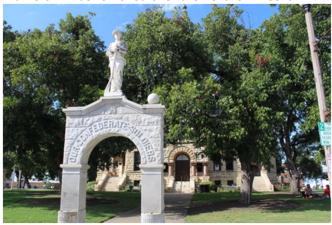
<u>Denton Confederate Soldier Monument</u> in Denton, TX. It is the intention of the County Commissioners to remove it from the Courthouse lawn. After consultation with the Texas Historical Commission the permit was granted. The county will have a year to relocate the monument on County property.