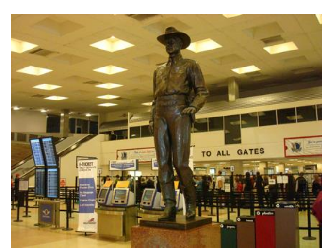
<u>One Riot, One Ranger</u> Bronze statue of a Texas Ranger Removed from Love Field Airport Dallas, Texas