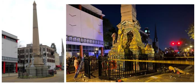
<u>Confederate Monument</u> in Portsmouth, Virginia. Four statues on the monument were decapitated and one pulled down by protesters on June 10, 2020. City campaign to completely remove it already underway.