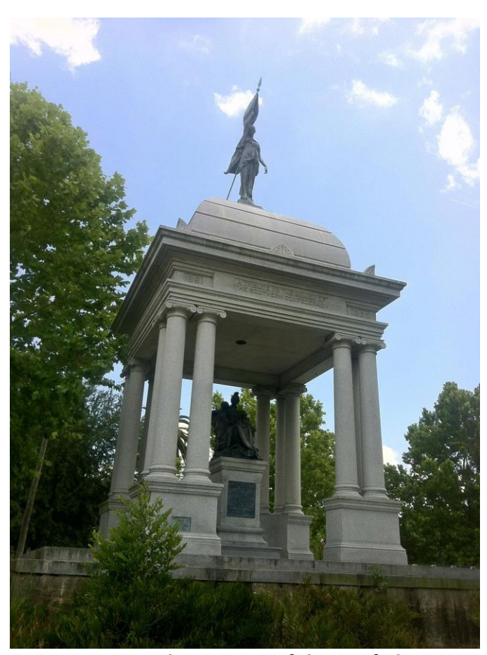
Monument to the Women of the Confederacy

What happened to this priceless precious work of art by heartless criminals was no doubt guided by the hand of Satan. Even worse the Mayor of Jacksonville, Florida has called for its complete removal. On June 9, 2020 Jacksonville Mayor Lenny Cury announced the removal of all Confederate monuments, memorials, and markers in the city including this one.