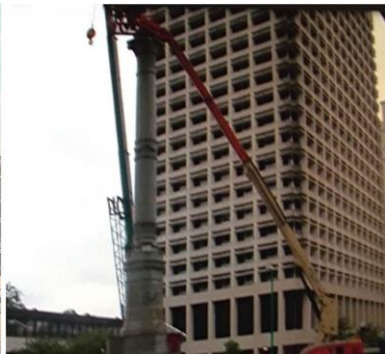
<u>Norfolk Confederate Monument</u> Norfolk, VA June 2, 2020 announced plans for removal by City. "Johnny Reb" statue atop the monument removed June 12.