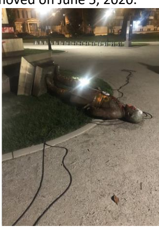
<u>Confederate General Williams Carter Wickham Statue</u> in Richmond, Virginia's Monroe Park near Virginia Commonwealth University's main campus. Toppled by protesters June 6, 2020.