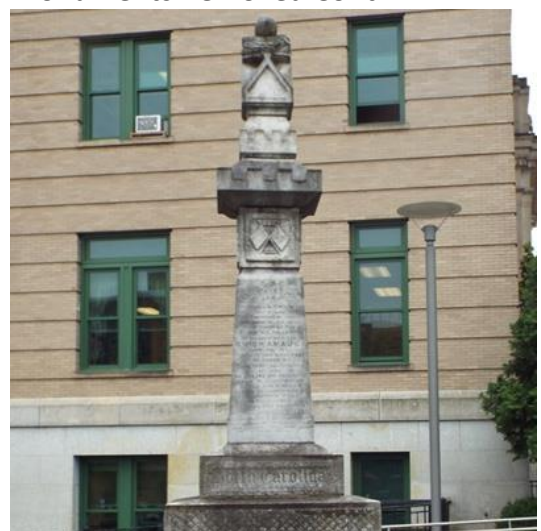
Monument to 60th Regt. NC Volunteers in Asheville, NC. Removal authorized by Buncombe County Commission June 16, 2020. Located in front of the county courthouse. The Daughters of Confederacy have 90 days to remove the monument.