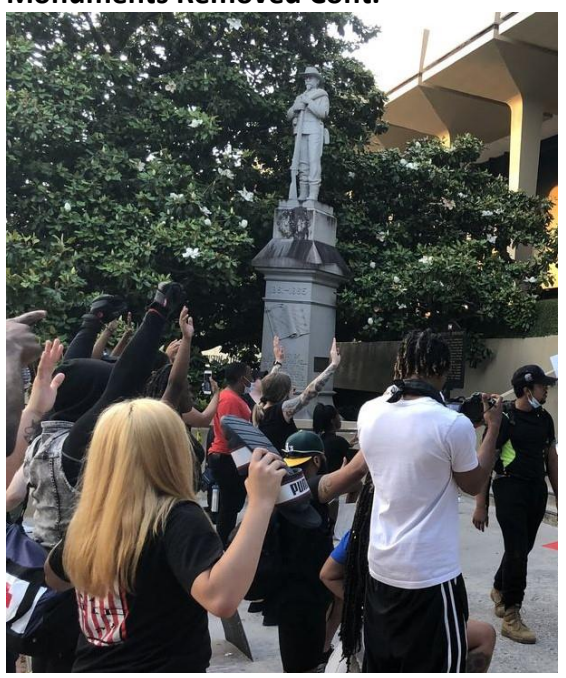
<u>Confederate Monument</u> in Huntsville, Alabama. Madison County Commissioners voted June 11, 2020 to relocate monument from the Courthouse lawn to a location to be determined.