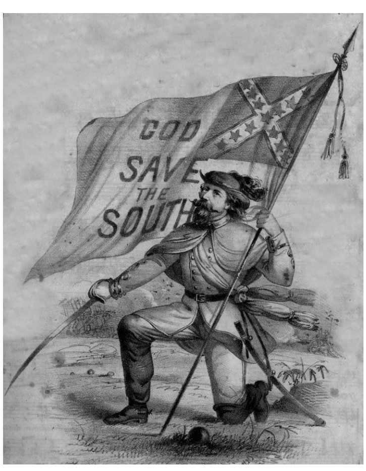
Continued Top of Page