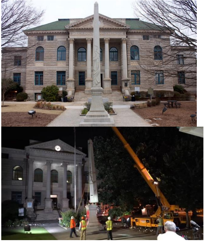
<u>Lost Cause Monument</u> in Decatur Georgia Ordered removed by County Judge on June 12, 2020 Removed June 19, 2020