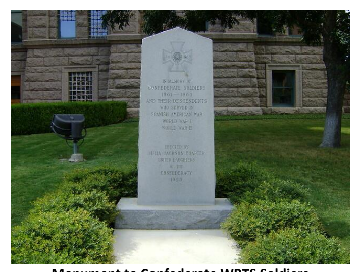
Monument to Confederate WBTS Soldiers Located on the grounds of the Tarrant County Courthouse in Fort Worth, Texas. The memorial was funded by the United Daughters of the Confederacy in 1953. Tarrant County commissioners voted June 9, 2020 to remove it soon as possible.