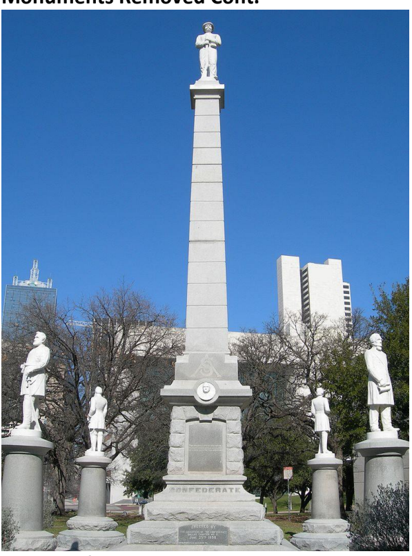
Confederate War Memorial in Dallas, Texas Pays tribute to the soldiers and generals from Texas during the WBTS. Located in Pioneer Park Cemetery in the Convention Center District of downtown. The monument will be placed in storage pending resolution of legal dispute over final disposition