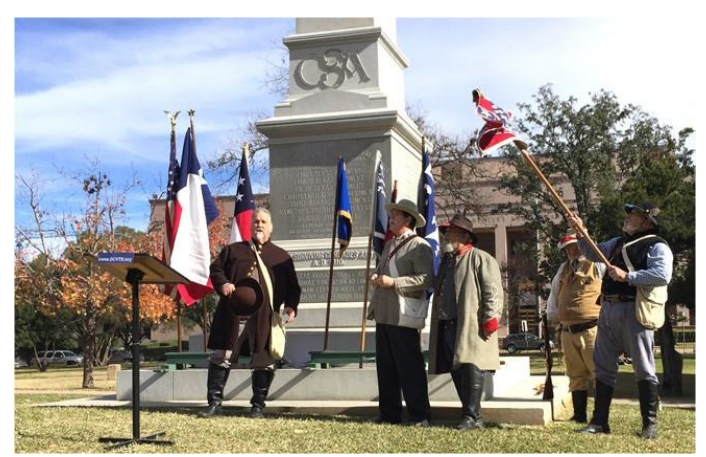
The ceremony ends with the traditional singing of "DIXIE" and waving the Confederate Battle Flag. YEEEEEE-HAWWWWWW

Special thanks to Jean Price for the pictures. Not only for these but for the dozens she took of visitors using their cameras while posing with us.