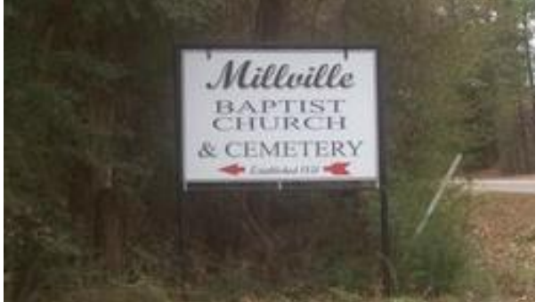
Look for this sign and possibly others

East Texas Chapter member Mark Appleton will preside over the ceremony complete with a color guard and rifle salute in addition to the cannonade. Period dress is encouraged for all DCV attendees.