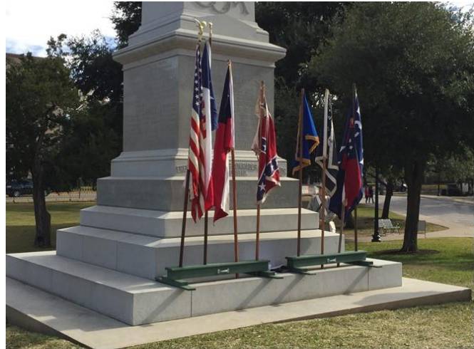
United States, Texas. 1<sup>st</sup> National, ANV, Bonnie Blue, 17<sup>th</sup> 18<sup>th</sup> Texas Cavalry, DCV