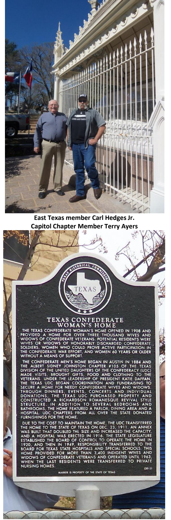
Confederate Woman's Home Historical Marker