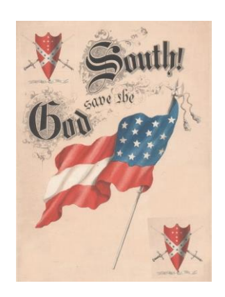
DCV Website www.DCVTX.org

But now, thank God, in their old age and decrepitude, they are being cared for by the whole people of Texas; and as they pass away their remains are laid to rest in the State Cemetery near the men who stood by them through life.