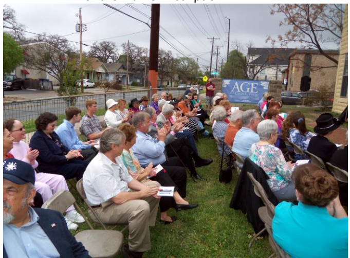
Excellent turnout for the dedication ceremony