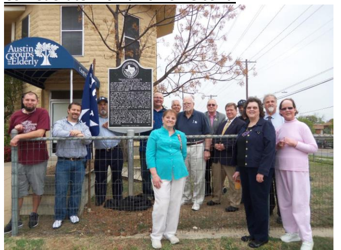
Members of the DCV celebrating the dedication of the Texas Confederate Woman's Home Marker