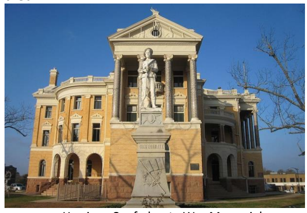
Harrison Confederate War Memorial