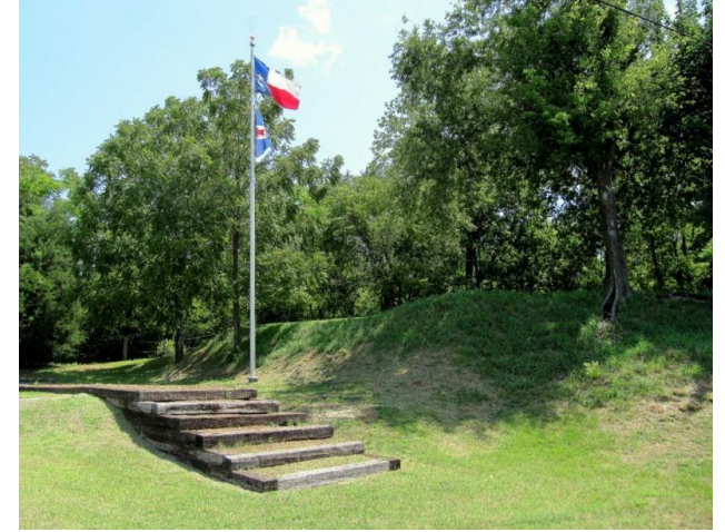
The Texas flag flies atop the pole at Grandbury's Lunette

Located in a light industrial area about two miles Southeast of the Cumberland River in Nashville is a small memorial designated as Grandbury's Lunette.