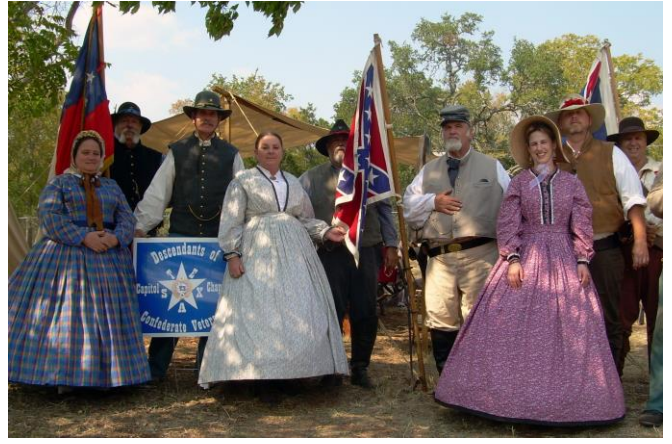
All members are encouraged to attend. For info: <u>http://www.drpoundhistoricalfarmstead.org/pione</u><u>er-day.html</u>

He was a proud member of the United Confederate Veterans. His framed membership certificate still hangs on the wall inside the historic home.